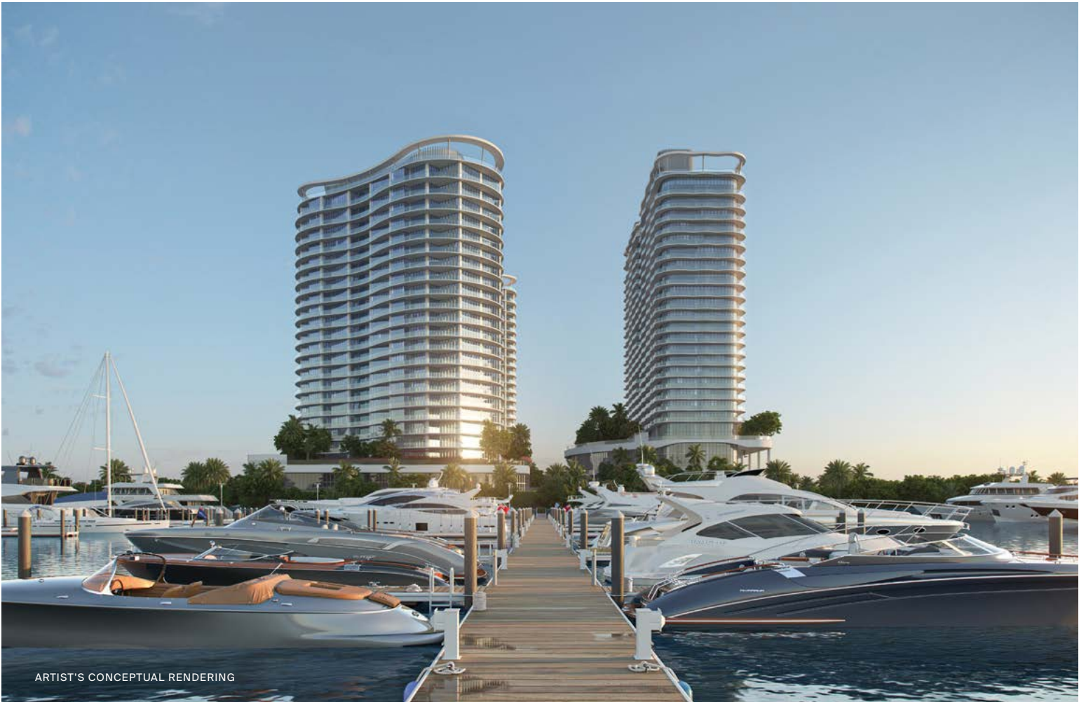
BAHIA MAR MARINA ACCOMMODATES MEGAYACHTS UP TO 350 FEET LONG