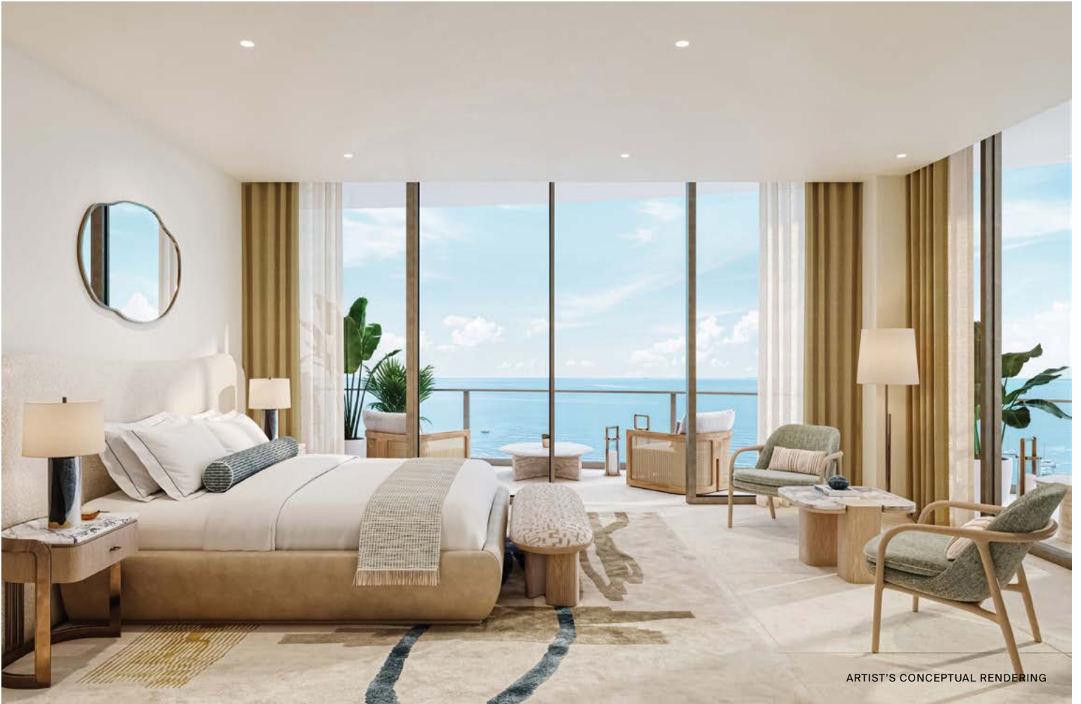
SEDUCTIVE, LIGHT-FILLED INTERIORS DESIGNED BY TARA BERNERD & PARTNERS