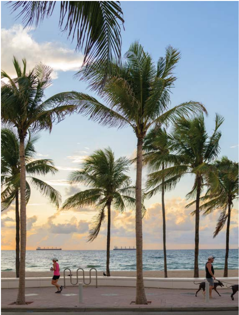
FORT LAUDERDALE OFFERS A BALANCE OF LAID-BACK BEACH LIFESTYLES AND VIBRANT URBAN ACTIVITIES